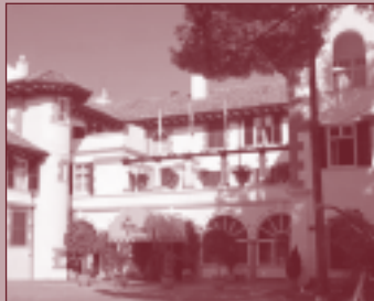
The Hotel Reina Cristina