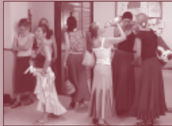
Students from previous courses